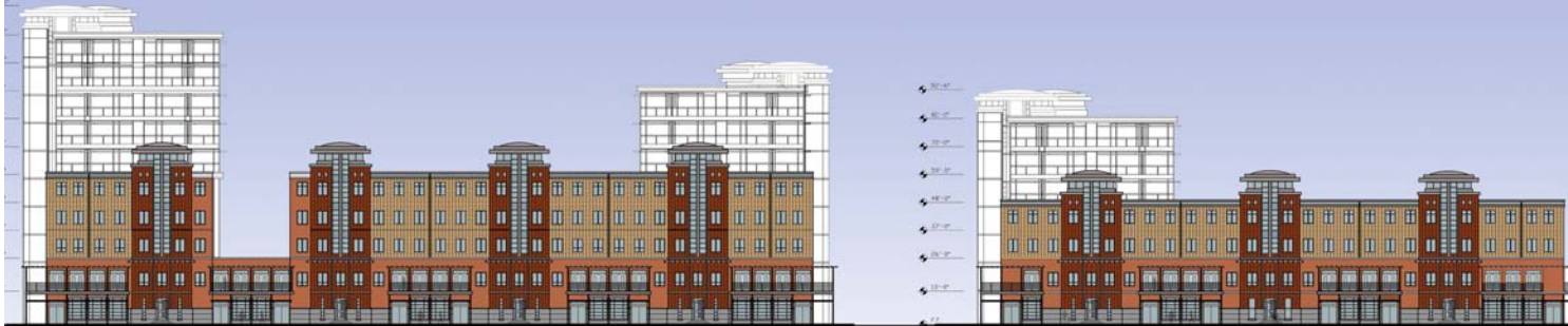
BROOKLYN STREET ELEVATIONS